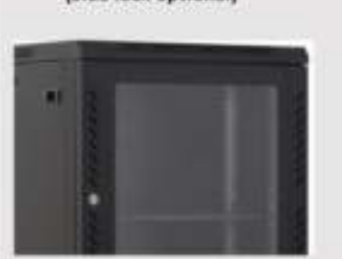
Front tempered glass door with metal perforated border